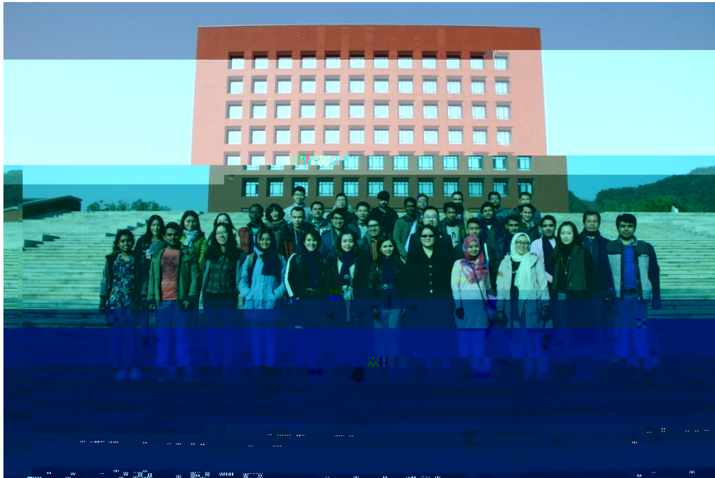
Group photo of 1 st Marine Scholarship of China exchange program, Nov. 9 to 13, 2015, Beijing