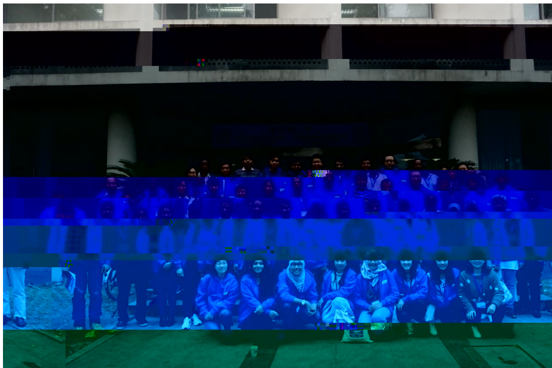
Group photo of 2 nd Marine Scholarship of China exchange program, Dec. 5 to 8, 2016, Zhejiang University